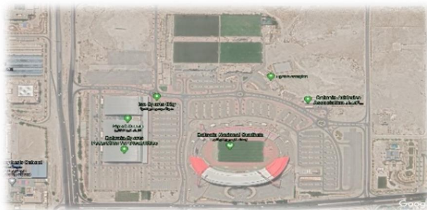
Isa Sports City