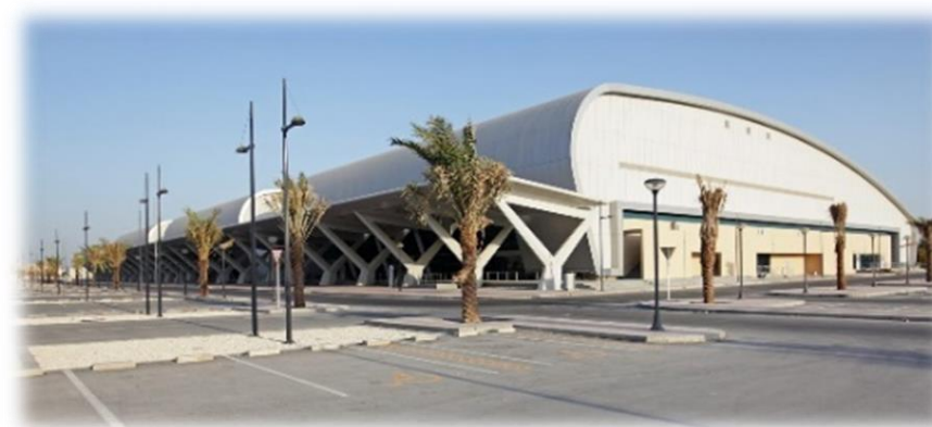
Sport Halls (B, C & D)