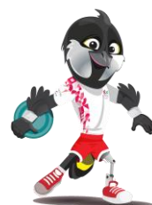
Khalifa Sports City Stadium