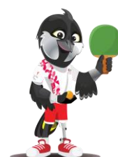
Para Table Tennis