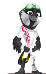
Khalifa Sports City Swimming Pool