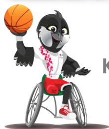
Khalifa Sports City Hall