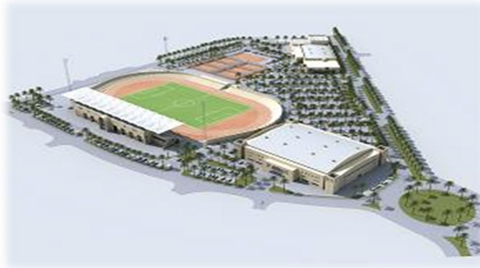
Khalifa Sports City